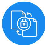
Fast CAD/CAE Files Sync & Share

Morro Data CloudNAS addresses the unique data challenges of the manufacturing industry by enabling faster large file access and collaboration, eliminating costly hardware investments, and offering built-in conflict resolution feature for seamless version control. With CloudNAS, manufacturers can drive innovation, adapt quickly, and achieve compliance, unlocking the full potential of digital transformation for enhanced efficiency, innovation, and success.