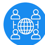
Real-Time Global Collaboration